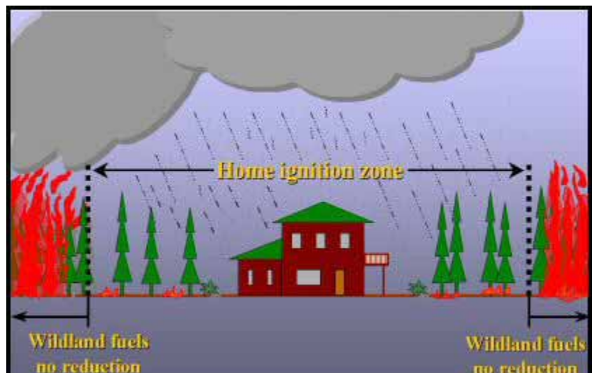
Image and Text Source: Emerging Knowledge about Wildland-Urban Interface Home Ignition Potential ; Jack D. Cohen, U.S. Department of Agriculture, Forest Service, Rocky Mountain Research Station, Fire Sciences Laboratory

Structural ignitability, rather than wildland fuels, is the principal cause of structural losses during wildland/urban interface fires. Key items are flammable roofing materials (e.g. cedar shingles) and the presence of burnable vegetation (e.g. ornamental trees, shrubs, wood piles) immediately adjacent to homes, also referred to as "survivable space".